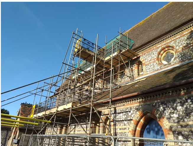
Scaffolding in place for investigations