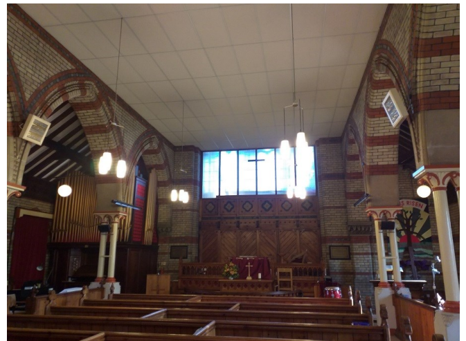
Inside showing the 1984 false ceiling