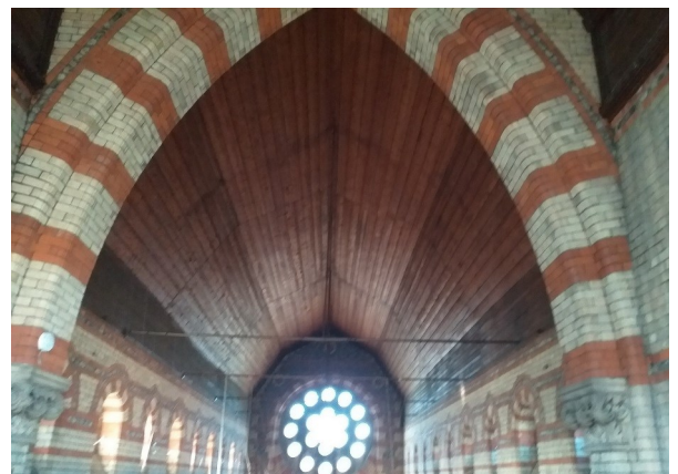
What very few people ever see