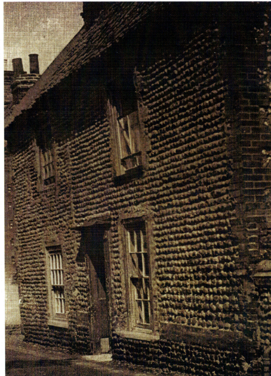
The present Chapel gates and Courtyard have replaced these Cottages condemned in 1937