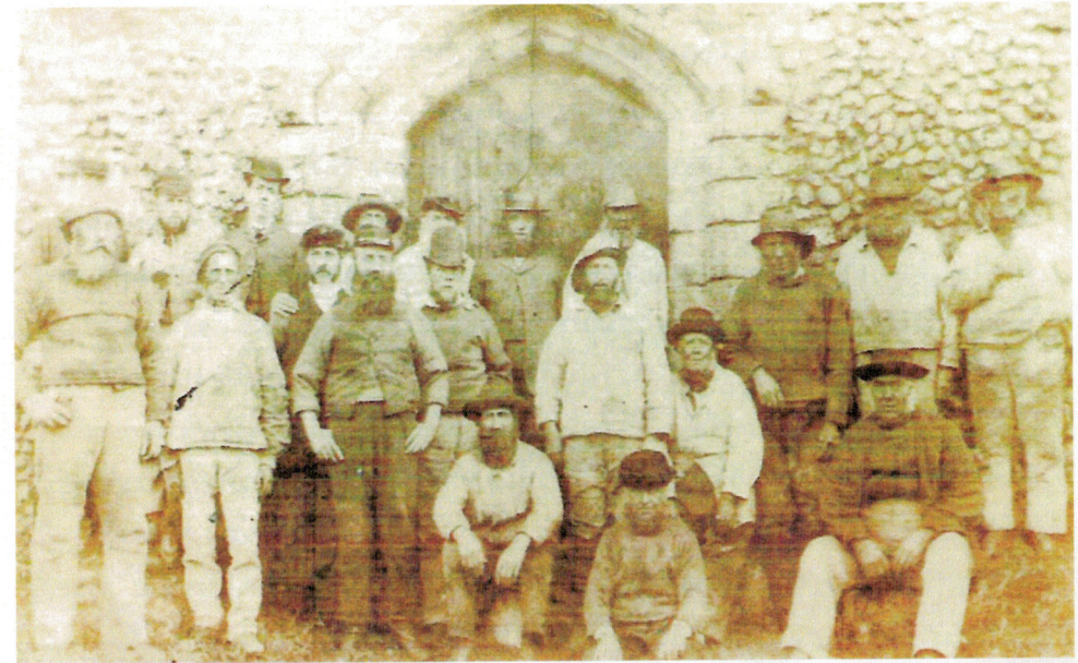
Men of Blakeney Harbour 1880