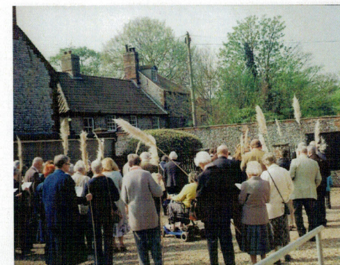
Palm Sunday gathering in the Methodist Chapel Courtyard 2012