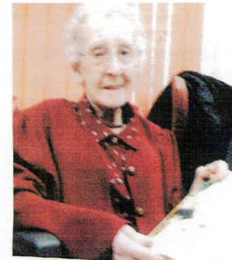
Reminiscing on 90 years . . . . . 100 years