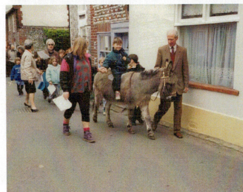
The donkey leads an ecumenical procession of witness through the village on Palm Sunday.