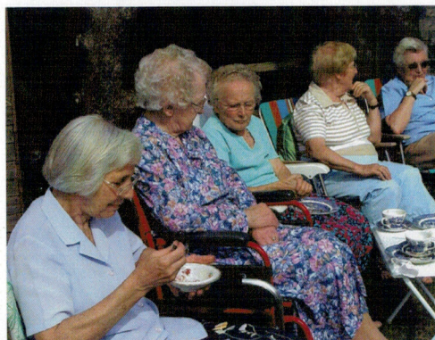
Tea in the garden

To raise funds for the upkeep of the building, many events are held by members in the chapel and throughout the village.