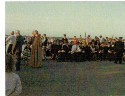
Thanksgiving services for the RNLI are held on the Quay every year during August and an archive is held by the Blakeney Area Historical Society.